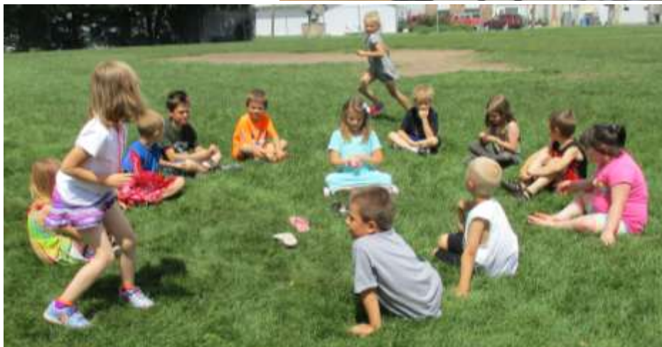
Students in the Wild, Wild West class playing a pioneer game called "Pass the Handkerchief"